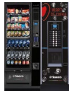
Artico M + Cristallo Evo 600

A-7000 Eisenstadt, Industriestraße 23-27 Tel.: 02682 / 66 111, Fax: 66 111 85